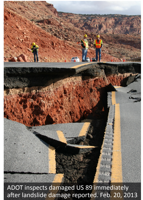
ADOT inspects damaged US 89 immediately after landslide damage reported. Feb. 20, 2013